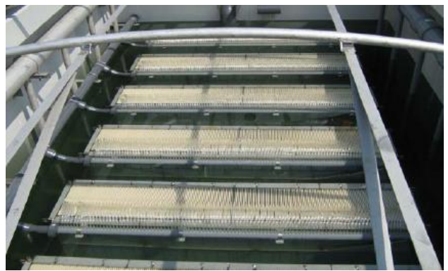
Photo of the four covered AnMBR tanks(left) and the membrane units inside the tank (right)