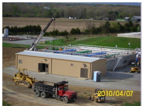
Photo of the new ADI-MBR system: 4 Membrane Tanks with Kubota RW400 units