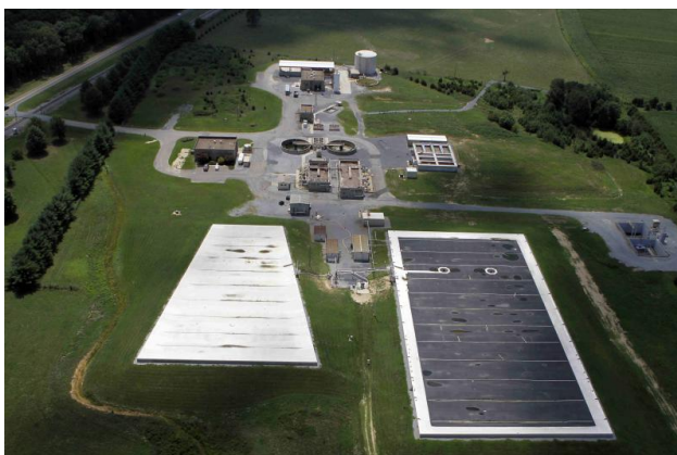
Photo of the ADI-BVF reactors (foreground), existing activated sludge system (center, background) and new ADI-MBR system (right, background)

The anaerobic zone of the new MBR selects for biological phosphorus removing bacteria, whereas the aeration and pre- and post-anoxic zones provide nitrification and denitrification. Aluminum sulfate is also included to remove phosphorus chemically. The four membrane tanks include Kubota submerged membrane units for solids-liquid separation and final effluent polishing prior to discharge to an existing chlorine contact process before final release to the Shenandoah River.